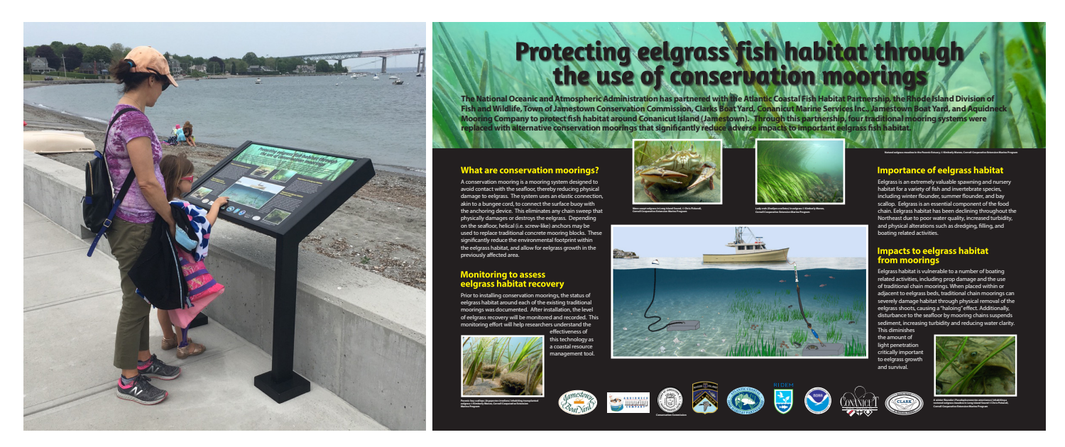
Figure 2. Seagrass habitat conservation signage in Jamestown, Rhode Island. Photo and sign courtesy of the Atlantic Coastal Fish Habitat Partnership.

An informed and involved public will provide a firm foundation of support for SAV protection and restoration efforts. Education and involvement is an important facet of increasing public awareness and stewardship (e.g. Figure 2).