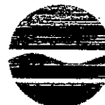
Joe Martens Commissioner

Office of Natural Resources, 14 th Floor 625 Broadway, Albany, New York 12233-1010 Phone: (518) 402-8533 • Fax: (518) 402-9016 Website: www.dec.ny.gov