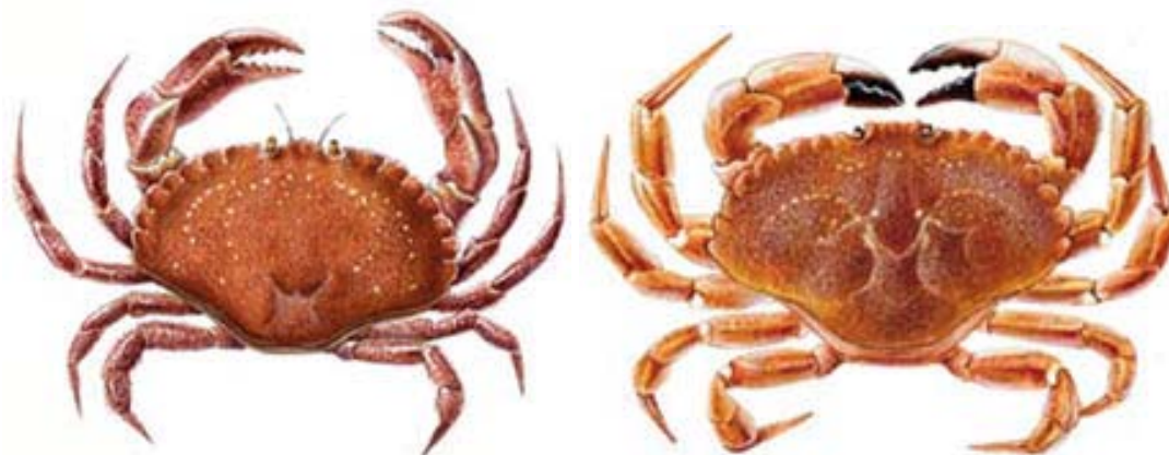
Figure 1. Rock Crab ( Cancer irroratus), left, and Jonah Crab ( Cancer borealis), right. The two species can be distinguished in a few ways. First, rock crab have purplish-brown spots on the carapace of while Jonah crab have yellow spots. Second, rock crab have smooth edges to the teeth on the edge of the carapace. Jonah crabs can be slightly larger than rock crabs a typically have black-tipped claws.

To facilitate public input, this document provides a broad overview of the four issues identified for consideration in the FMP, as well as background information on the cancer crab stocks, fisheries, and management. The underlying questions for public comment are: “How would you like the Cancer crab fishery and population to look in the future?” The Commission is looking for both general comments on the Cancer crab management in state waters and/or any comments specific to the issues listed in this document.