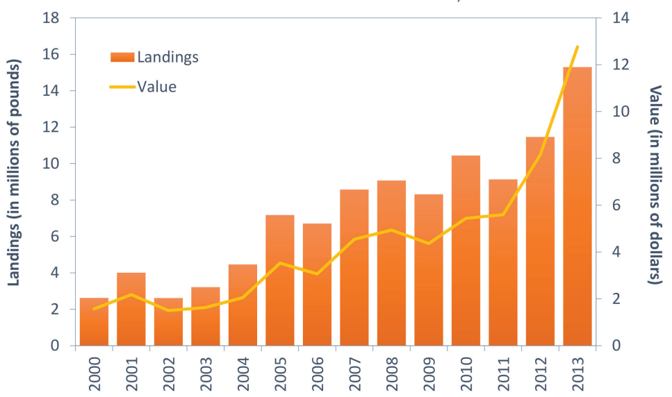
Note: Misidentification between Jonah and rock crab is common. Species-specific landings may be inaccurate.