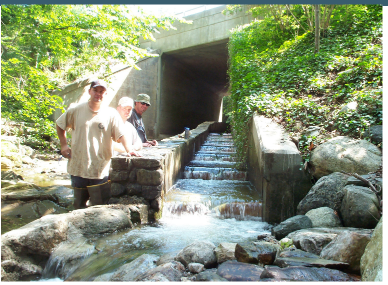
Furnace Brook Fishway.

The first known fishway was built in 17<sup>th</sup> century France, when bundles of branches were used to create steps in otherwise impassible channels. A few other reports of constructed fishways are sprinkled