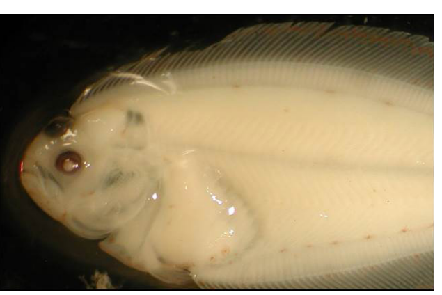
Image of a juvenile summer flounder.