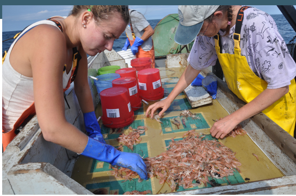
Northern shrimp being sampled on the Gulf of Maine Summer Shrimp Survey.

Implemented in 2011, Amendment 2 responded to these issues and completely replaced the FMP. The Amendment provides management options to slow catch rates throughout the season, including trip limits, trap limits, and days out of the fishery. Additionally, Amendment 2 modifies the fishing mortality reference points to include a