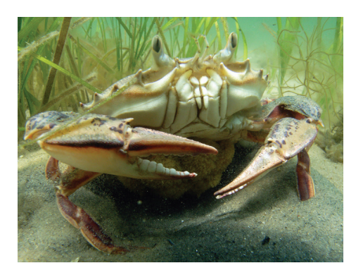
Photos from top to bottom: Winter flounder in eel grass © Chris Pickerel, Cornell Cooperative Extension; Peconic bay scallops (Argopecten irradians) inhabiting transplanted eelgrass © Kimberly Manzo, Cornell Cooperative Extension; and Lady crab (Ovalipes ocellatus) in eelgrass © Kimberly Manzo, Cornell Cooperative Extension