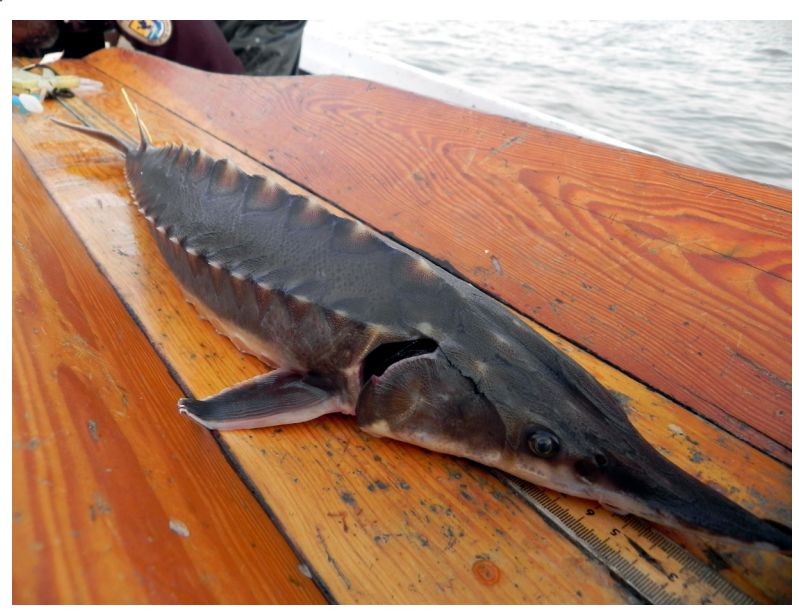
Atlantic sturgeon being measured as part of a Cooperative Federal/State/ Industry Atlantic Sturgeon Bycatch Reduction Survey.

Despite the genetic differences between Atlantic sturgeon in each of the five DPSs, the Commission manages the species as a single coastwide population. Atlantic sturgeon is managed through Amendment 1 to the Interstate Fishery Management Plan for Atlantic Sturgeon