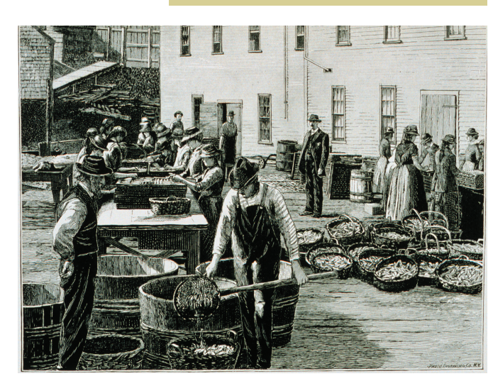
THE SARDINE INDUSTRY: Washing, draining, and flaking herring at the sardine cannery, Eastport Maine.

Stock Status: Not overfished and not experiencing overfishing