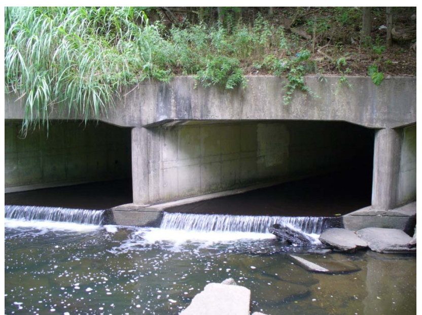
Example of a perched culvert. In this case, downstream weirs can raise the elevation of the water surface to allow fish to swim over the lip.

Full span, bottomless arched culverts that maintain natural substrates are also effective. Setting one box culvert lower than the others in a multiple box installation will provide a minimum flow channel that can effectively pass fish during low flow periods. The installation of baffles inside culverts can be helpful. Perched culverts are usually best addressed by a complete replacement with a culvert that is flat and recessed below streambed level. However, in some cases, the installation of downstream full-width weirs can back-flood a stream up to the elevation of the downstream lip of the culvert.