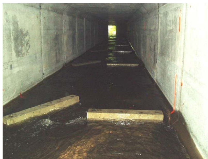
Off-set baffles inside a culvert can reduce velocities and deepen flow to make it passable. In this example, there is a second box with a six-inch lip on the upstream end that diverts all low flow into this box, providing enough water during low flow summer months to pass fish.